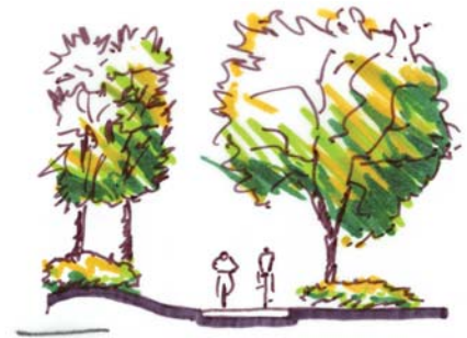
SHARED USE TRAIL