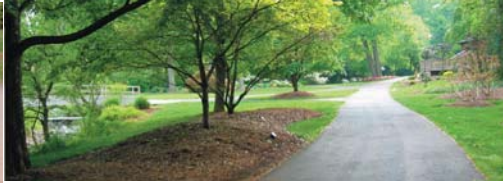
SHARED USE RECREATION SYSTEM